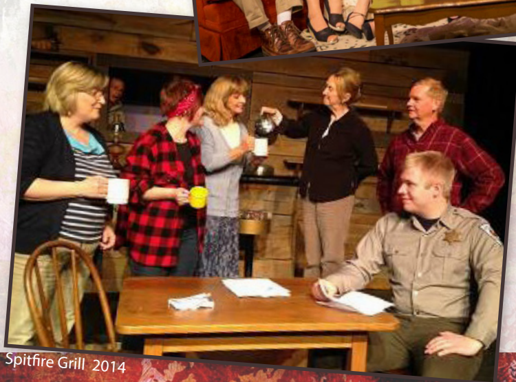
Spitfire Grill 2014