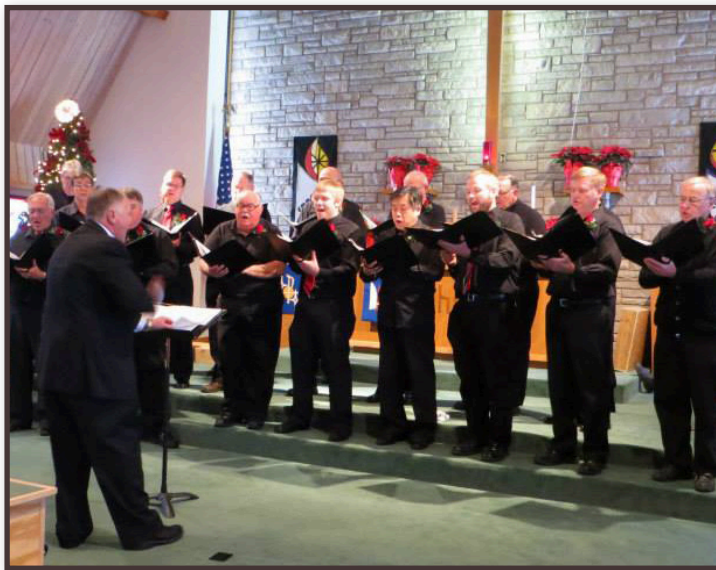
ETC's Cumberland Community Christmas Choir Concert 2013